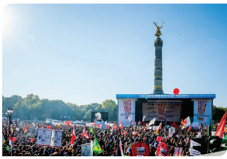
CETA protests in Berlin, 2015

Modern free trade agreements, unlike those of the past, are less about taking down barriers to the trade in goods and more about challenging what are called "non-tariff barriers" - rules and regulations that protect, among other things, water, forests, soil and air. Free Trade Agreements such as CETA, the Canada-EU Comprehensive Economic and Trade Agree-