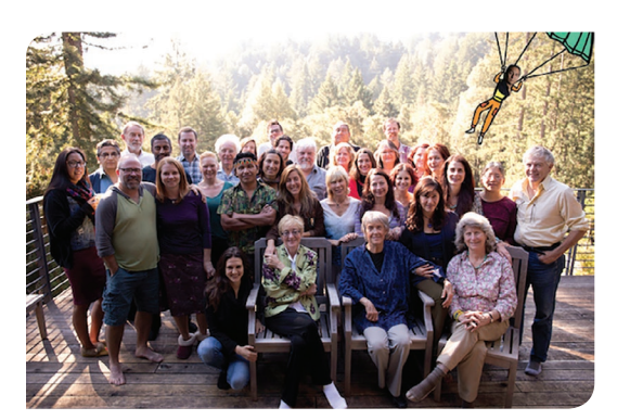
Participants at the Stillheart Institute

In October 2013, on Ohlone Indigenous land, Global Exchange and partners held a 3-day summit at the Stillheart Institute in Woodside, California. Nestled in the California Redwood forest a counsel of 32 global social movement leaders including Indigenous leaders, deep ecologists, grassroots justice advocates, economists, climate experts, localization activists, globalization thinkers, writers and researchers were convened to examine the emerging legal framework known as Rights of Nature, or Rights of Mother Earth. This declaration emerged and is affirmed by the undersigned participants.