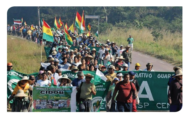
Bolivia: Indigenous peoples mobilize against highway through the rainforest

On August 15th, 2011, around one thousand Indigenous people of the lowlands of Bolivia started in the city of Trinidad the "Eight March of Indigenous people" in defense of TIPNIS. The march was dismissed by the government from the beginning. When it arrived the 25th of September to the locality of Chaparina five hundred policemen intervened violently and dissolved the march detaining hundreds of people.