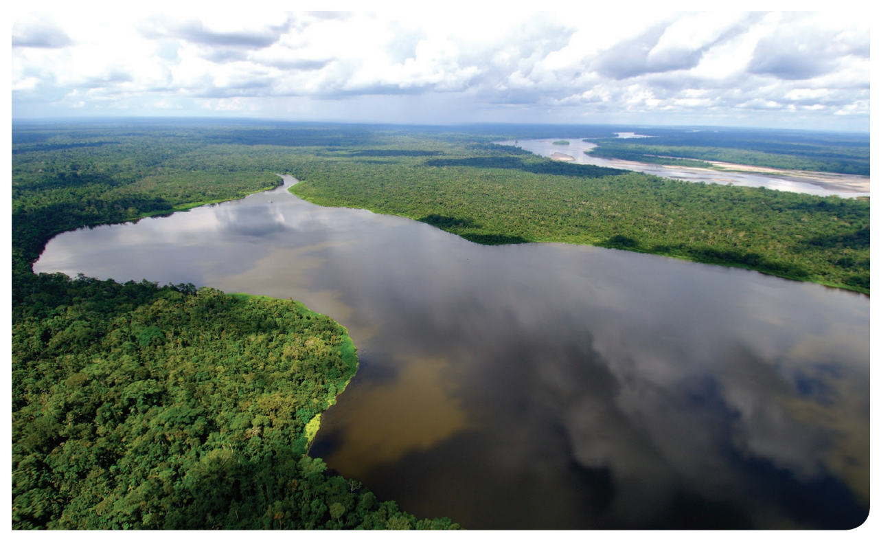
Orellana Province, Ecuador

"The message our Living Forest proposal delivers is aimed at the entire world with the goal of reaching the hearts and minds of human beings everywhere, encouraging us all to reflect on the close relation between Human Rights and the Rights of Nature." From Kawsak Sacha, The Living Forest: An Indigenous Proposal for Confronting Climate Change, presented by the Amazonian Kichwa People of Sarayaku, Ecuador