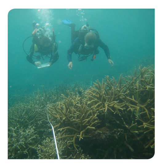
Scientists study the deterioration of the Great Barrier Reef

However that perspective overlooks the fact that judgements such as this provide an example of what kind of judgement is possible and thereby expose the inadequacies of existing legal systems in the face of challenges like climate change. The Tribunal demonstrates that if international and national judicial bodies decided cases involving the critical challenges of the 21st Century in the same way as the Tribunal does, then law could make a far more significant contribution to addressing climate change that it does now.