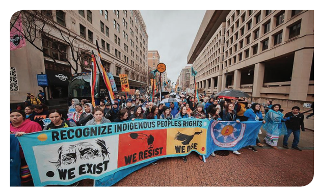
Native Nations Rise March

Our first environment is water. We live in water throughout gestation inside our mother who then gives birth through water - Mni Wiconi